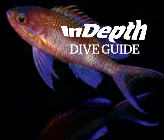
PARK LIFE: above, an anthia; left, a red scorpionfish, below left, a triggerfish